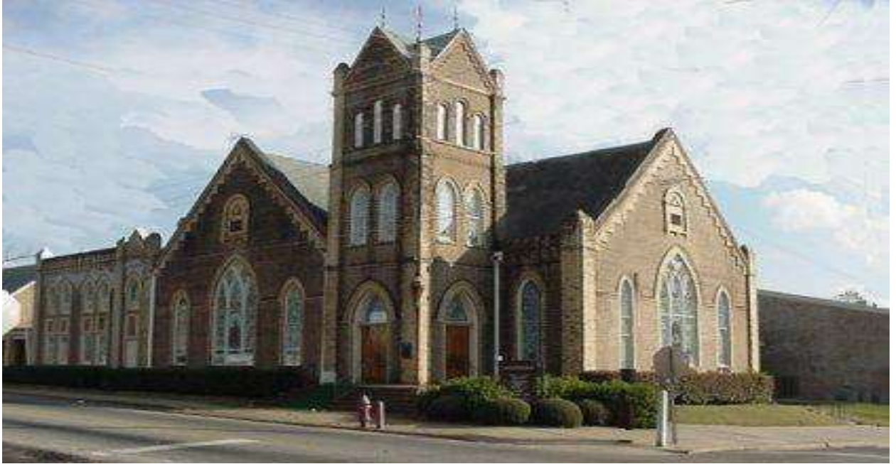
FIRST UNITED METHODIST CHURCH