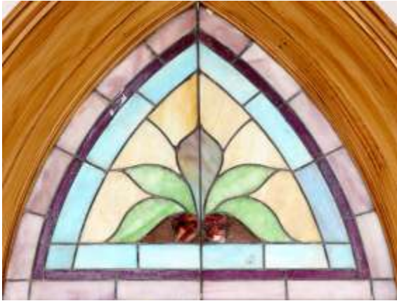
BACK WEST DOOR