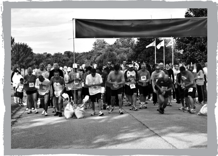
First Annual Celebration of Life Walk/Run

In September of 2011, SSEEO held its first annual Celebration of Life Walk/Run. Many came from Northern Illinois and Southeastern Wisconsin to participate in this fun-filled event. The day featured health screenings, stroke education and fitness provided by SSEEO sponsor hospitals. Over 500 participated in the celebration with a DJ and cheerleaders encouraging the survivors and others along the course.