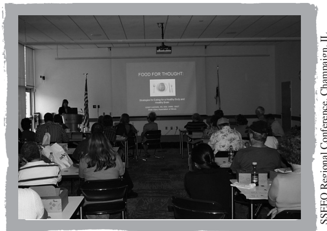
SSEE Regional Conference, Champaign, IL

The annual stroke conference continues to grow with over 117 registering for this year's event. The conference presentations included speakers on Emotional Recovery after a Stroke and the SSEE Board of Directors as a panel discussion on your "new normal". To help reach our expanding network of stroke survivors, SSEE hosted two additional educational events in Waukegan and Champaign, IL. These two events included health screenings and presentations. Over 250 people participated in these stroke outreach activities.