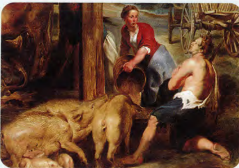
THE PRODIGAL SON, PETER PAUL RUBENS