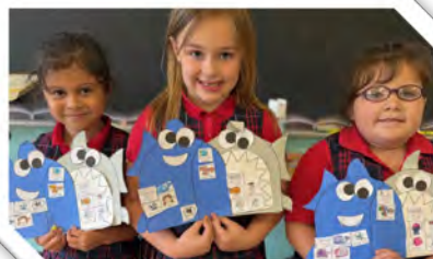
Left & Right: The kindergarten students compared & contrasted sharks & dolphins this week. They also learned that jellyfish are not fish at all!