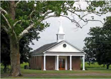
St. Mary of the Lake Church 626 Horseshoe Circle Horseshoe Lake, AR 72348 Sunday Vigil – Saturday 4 pm

St. Michael Every Tuesday, 11:00 a.m. to 1:00 p.m. Sacred Heart, Crawfordsville, Every Friday, 11:00 a.m. to 1:00 p.m. Every Saturday, before the Vigil Mass 5:30 to 6:30 p.m.