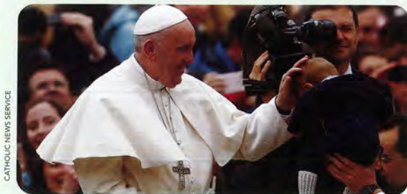
CATHOLIC NEWS SERVICE