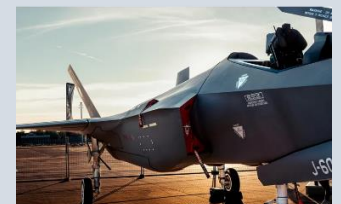
Ace - $500