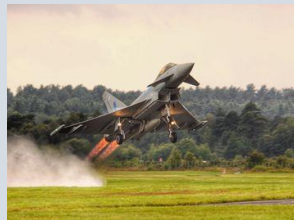
Takeoff - $250