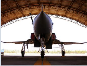
Hangar - $25

As a member of the Wilbur Wright Preservation Society, Yearly or Lifetime Membership includes: 10% discount at our gift shop, $100 community room rental , FREE admission . *Military, First Responders, and Seniors over 60 will receive a 10% discount for admission and gift shop purchases without the need for membership, upon presenting Photo I.D.