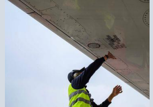
Maintainer - $50