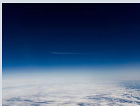
Stratosphere - $1000