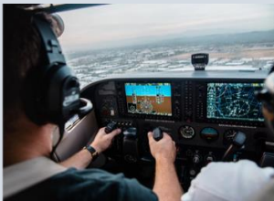
Pilot - $100