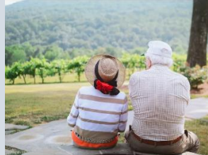
Senior Couple - $40