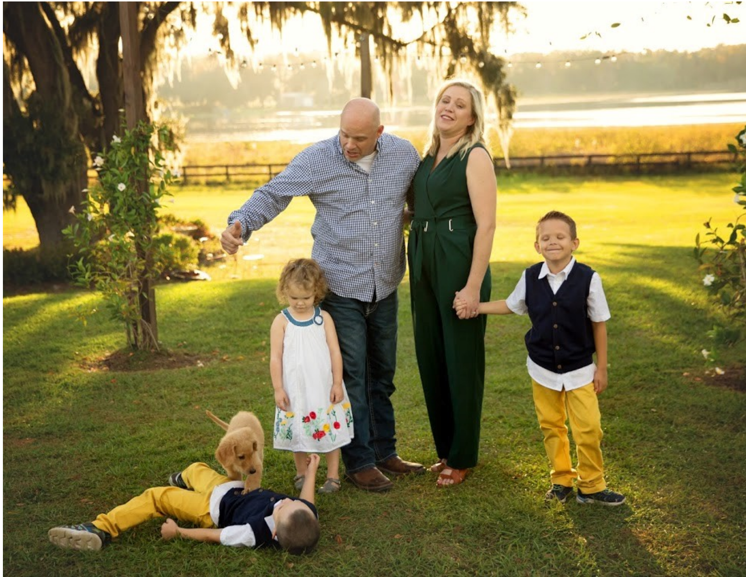
"Behind the Scenes"