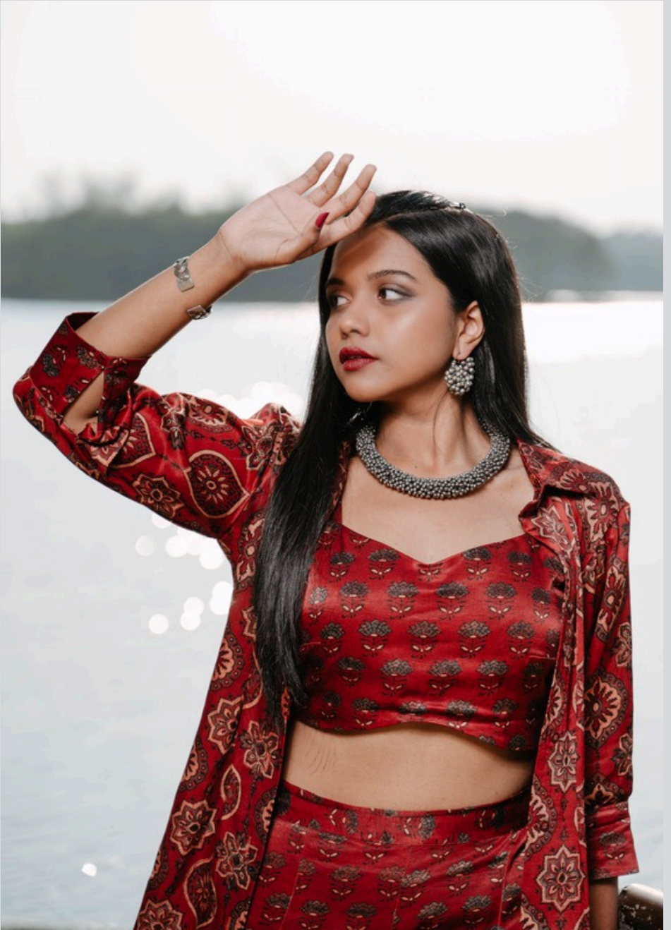
The structured-yet-fluid shirt pairs effortlessly with high-waisted tailored pants, thoughtfully detailed with subtle slits, refined tailoring, and functional ease for everyday wear.