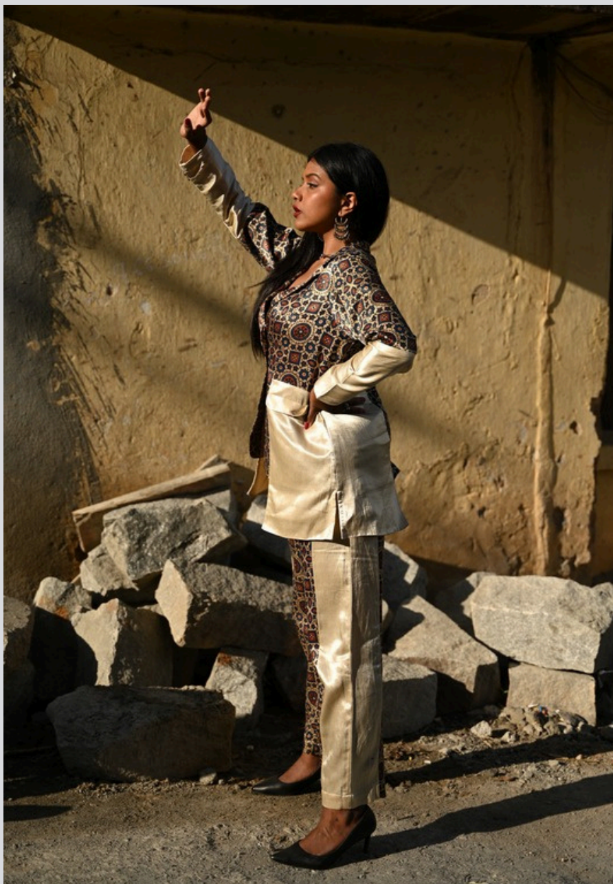
A contemporary two-piece co-ord set featuring a double-breasted blazer with a striking high-low silhouette, notch lapel collar, and thoughtful slits for effortless movement. Paired with high-waisted tailored pants designed with a structured waistband, elasticated back, and functional pockets for all-day ease