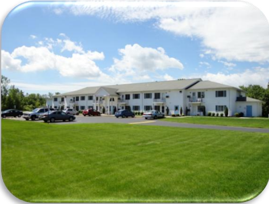
Lewiston Villa 930 Upper Mountain Road Lewiston NY 14092 24 One Bedroom Apartments