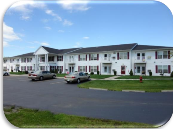
Lewiston Meadows 922 Upper Mountain Road Lewiston NY 14092 24 One Bedroom Apartments