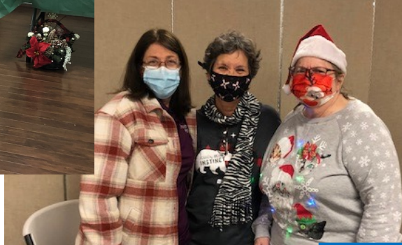
The three Amigos.