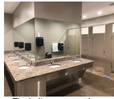
The ladies renovated bathroom behind the east wall.