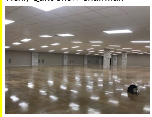
Overall view of the annex.