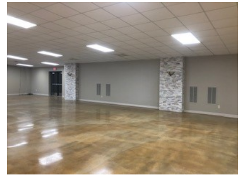
East wall. Doorway on the left leads to the garage door. The fake wall hides the entrances to the bathroom.