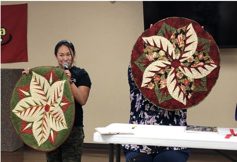
Samples of the Poinsettia Table Topper for the November 16 workshop.

MARCH 13 - 15 WMQG retreat & Bargello Quilt Workshop by Norma Reel sign up is open. Contact Lenor