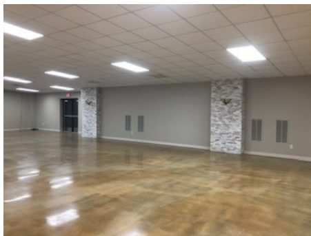
East wall. Doorway on the left leads to the garage door. The fake wall hides the entrances to the bathroom.