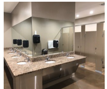
The ladies renovated bathroom behind the east wall.