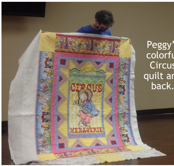
Peggy's colorful Circus quilt and back.