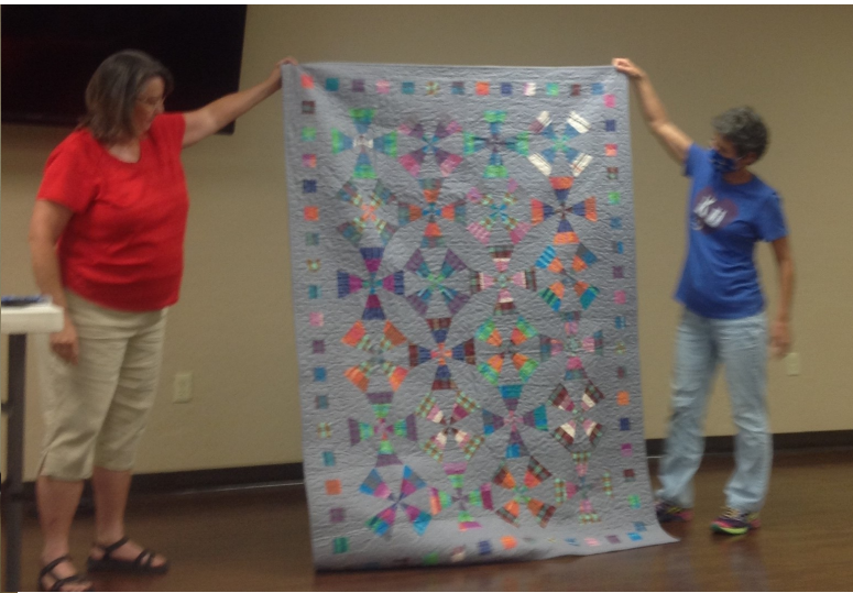
Kathy's beautiful colorful and gray quilt