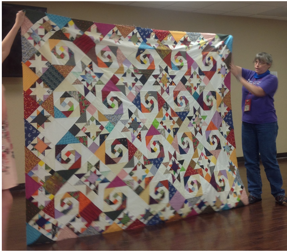
Above is Cris's beautiful, intricate, colorful quilt. Below is Vicki's shimmering color explosion quilt.