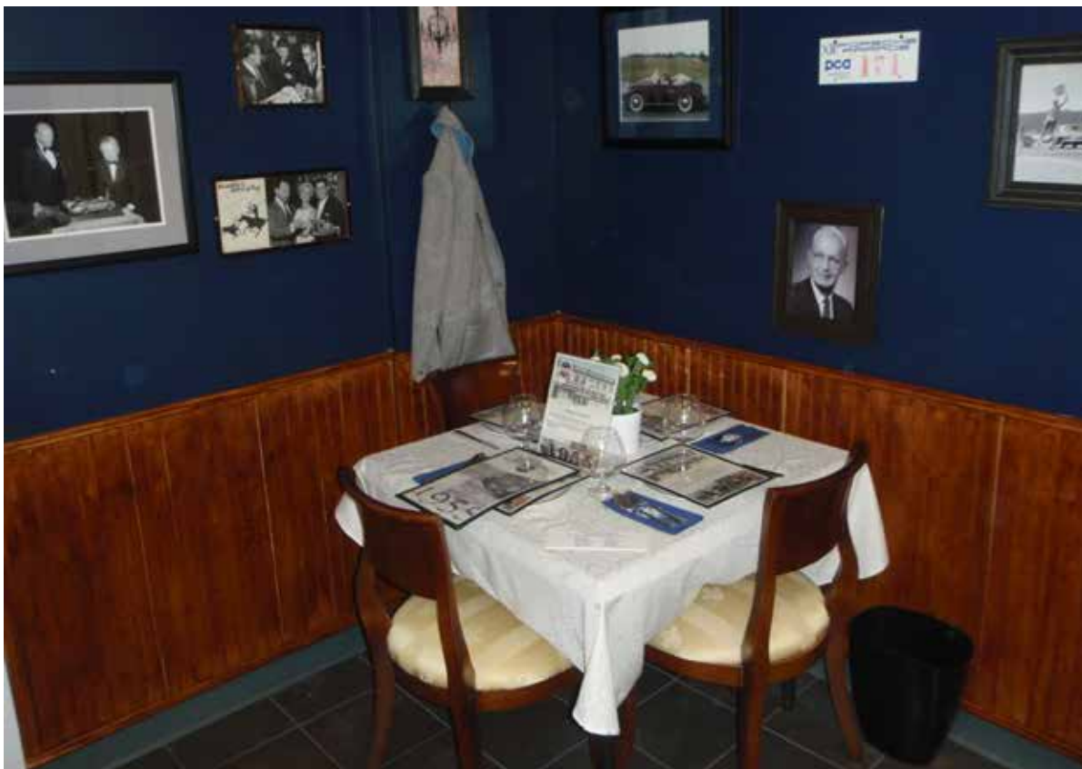
PCA Headquarters Reproduction of First PCA Meeting

inventoried by category so that anyone looking at that inventory list can find what they need. A simple schema is to number each shelving unit and letter each shelf in the unit. Then label each box with the unit number, shelf letter, and a box number. It never hurts to also put the category or categories on the outside of the box. For example, the category of Anniversaries could be: 3.B.6 that is: Shelving Unit #3, Shelf B, Box 6.