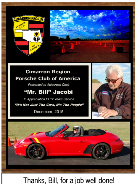
Thanks, Bill, for a job well done!

If you weren’t able to attend, be sure to put it on your calendar for 2016.