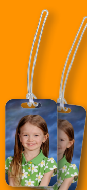
Special 18 2 - 2-Sided Metal Bag Tags - $16