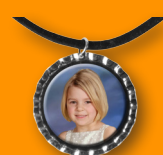
Special 17 1 - Bottle Cap Necklace - $15