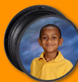
Special 21 1 - Phone Grip - $18