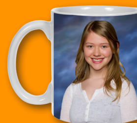
Special 19 1 - Coffee Mug - $15