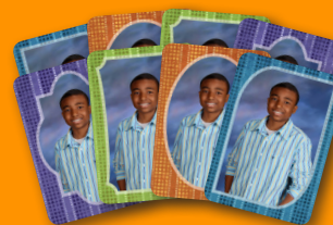
Special 13 8 - Wallet Magnets - $15

Available ONLY with purchase of packages 1-7. Products are not shown to scale.