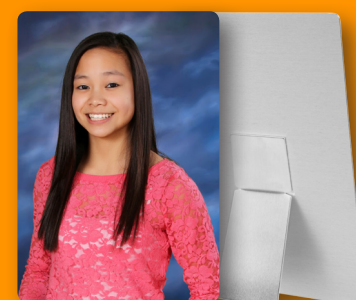
Special 20 1 - 4x6 Aluminum Desk Print - $21