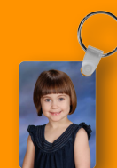
Special 15 1 - 2-Sided Metal Keychain - $16