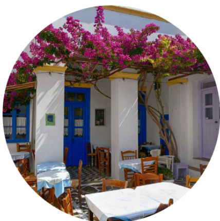
Photo Shoot - Sarakaniko Beach