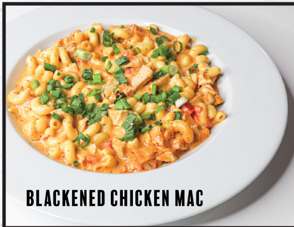
BLACKENED CHICKEN MAC

Grilled or hand-breaded shrimp served with warm melted butter or cocktail sauce