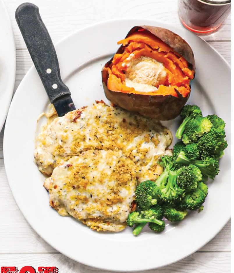
^ PARMESAN CRUSTED CHICKEN