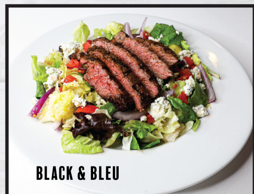
BLACK & BLEU

DRESSINGS: Ranch, Bleu Cheese, 1000 Island, Golden Italian, Honey French, Honey Mustard, Apple Vinaigrette, Oil & Vinegar