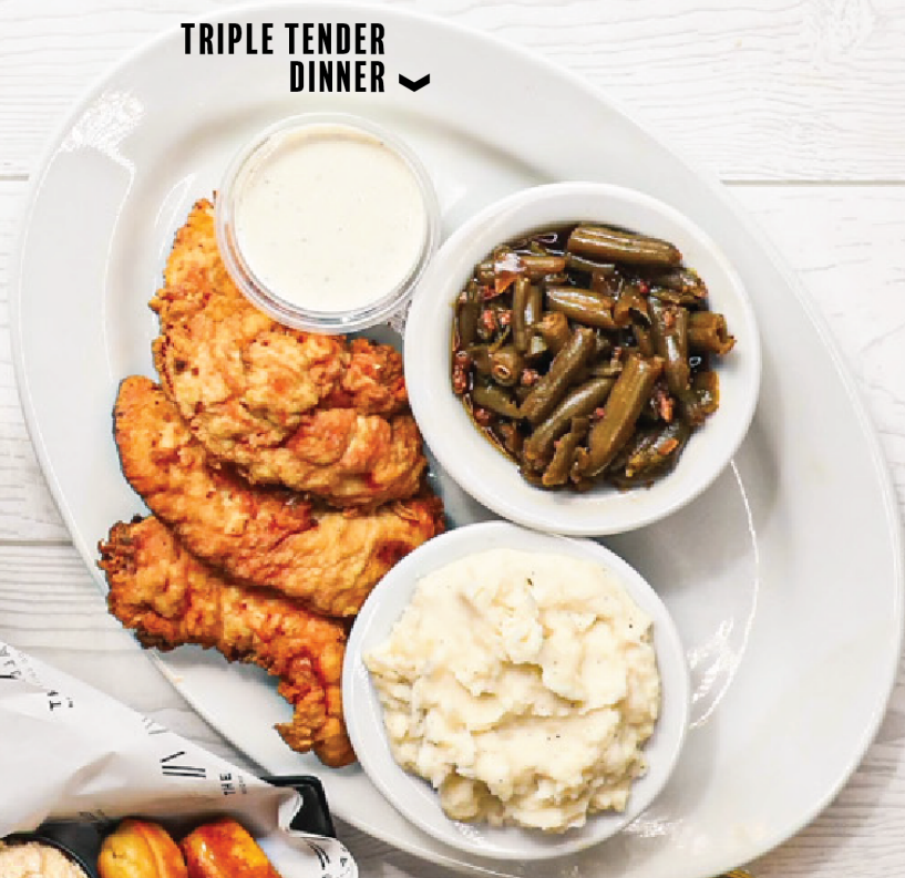
TRIPLE TENDER DINNER v