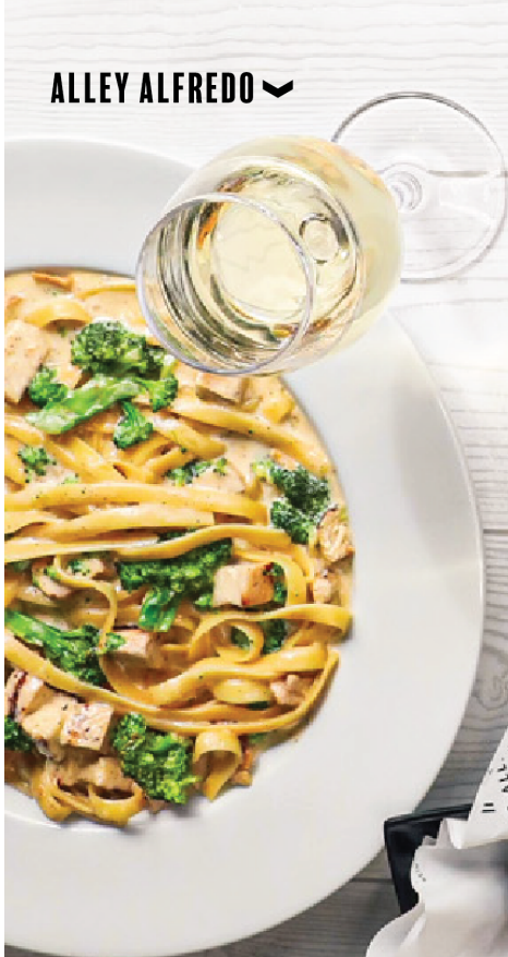
ALLEY ALFREDO v