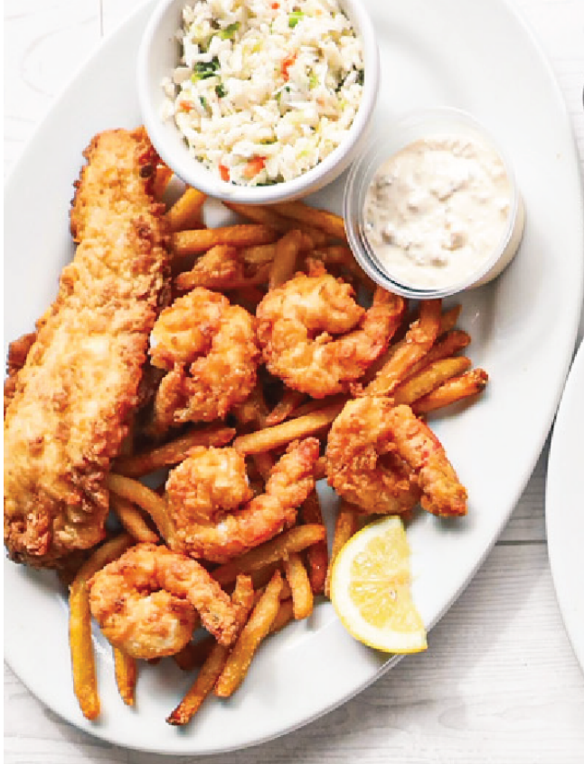
SEAFOOD COMBO ^