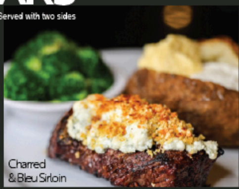
Charred & Bleu Sirloin