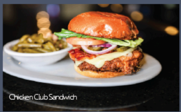
Chicken Club Sandwich