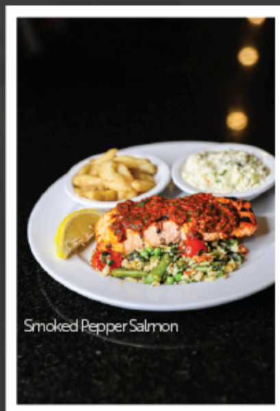
Smoked Pepper Salmon