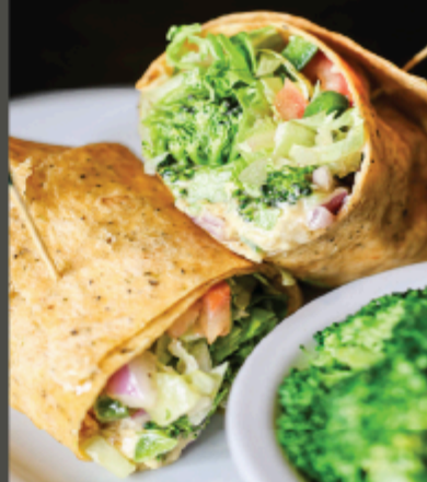
Harvest Hummus Wrap