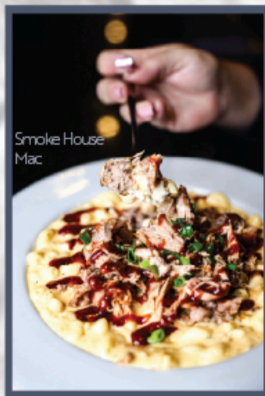
Smoke House Mac

Fettuccine tossed in a creamy parmesan sauce with steak tips, onions, & mushrooms - 17