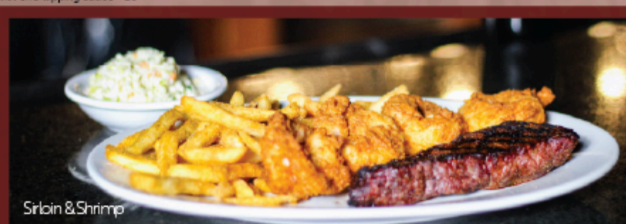
Sirloin & Shrimp

8oz. Sirloin & 1/3 rack of Sweet BBQ Ribs - 30