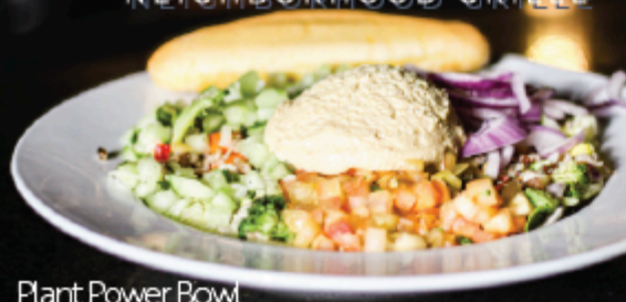
Plant Power Bowl