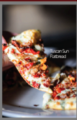
Tuscan Sun Flatbread

Ranch, cheddar cheese, mozzarella cheese, grilled chicken, bacon, & red onion - 14