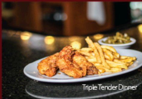
Triple Tender Dinner

SAUCES: Original Buffalo, Hot Honey Garlic, Sweet BBQ, Bourbon Glaze, Sweet Chili, Teriyaki, Carolina Gold BBQ *Ask about our monthly sauce! **EXTRA SAUCE - 1 ***RANCH OR BLEU CHEESE - 1