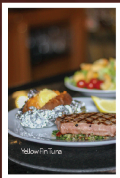
Yellow Fin Tuna