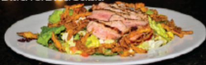
Black & Bleu Salad

Fresh mixed greens topped with red onions, green peppers, cucumbers, tomatoes, hummus, and The Alley's vegetable & grain medley. Add grilled chicken or a black bean patty for an additional charge - 15