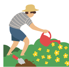
WORKING ON A PROJECT

To channel anxious thoughts or feelings in more productive ways, we might identify specific outlets to express creativity, such as working on a project, drawing, and athletics.