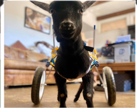
NATIONAL SPECIALLY ABLED PETS DAY - MAY 3

Family is love, Every shape, color, and size, Joined in hearts and minds.