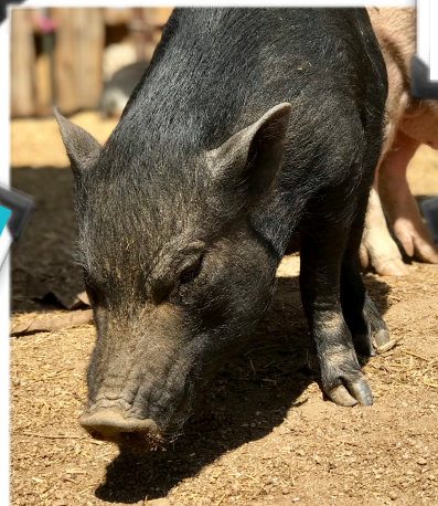
NATIONAL ZIPPER DAY - APR 29