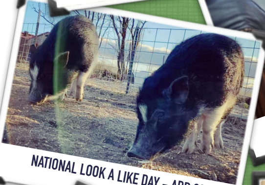
NATIONAL LOOK A LIKE DAY - APR 20