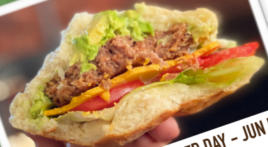
NATIONAL VEGGIE BURGER DAY - JUN 5