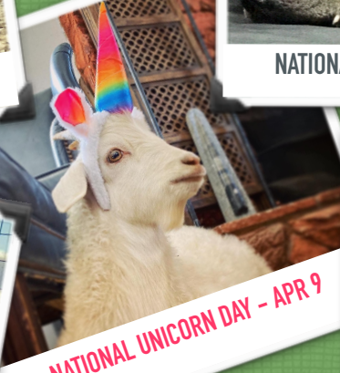
NATIONAL UNICORN DAY - APR 9