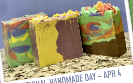
NATIONAL HANDMADE DAY - APR 4