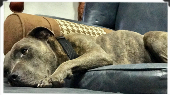
NATIONAL ADOPT A SHELTER PET DAY - APR 30