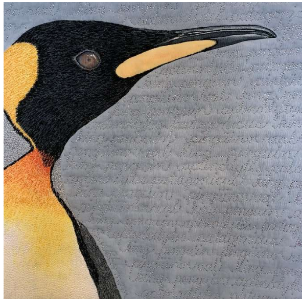
(Optional) Class project: King Penguin