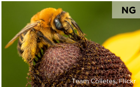
Long-horned bees ( Melissodes spp.)