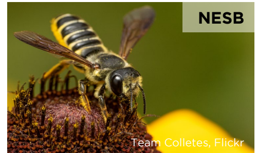
Leaf-cutter bees ( Megachile spp.)