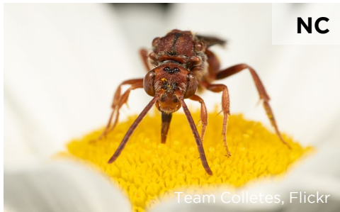
Cuckoo bees ( Nomada spp.)