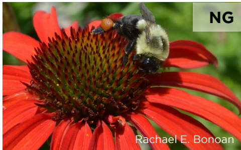
Bumble bees ( Bombus spp.)