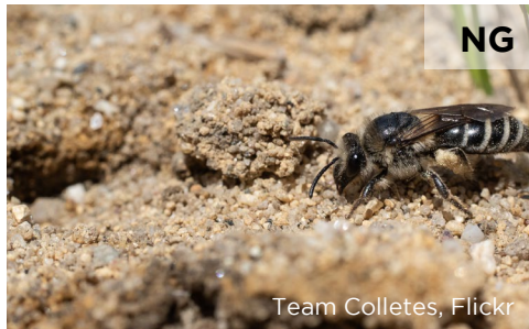
Cellophane bees ( Colletes spp.)