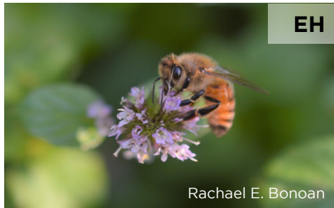
Honey bees ( Apis mellifera )