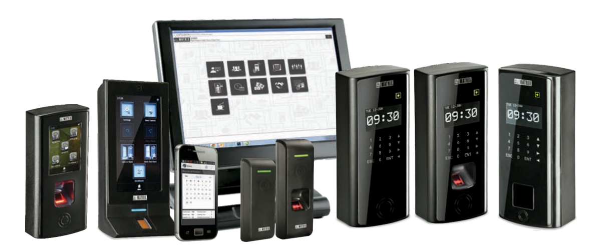
MATRIX COSEC SOLUTIONS