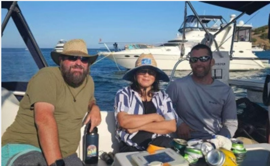
Relaxing at Emerald Bay