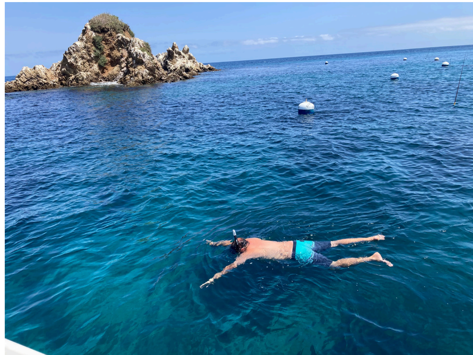
Snorkeling at Emerald Bay