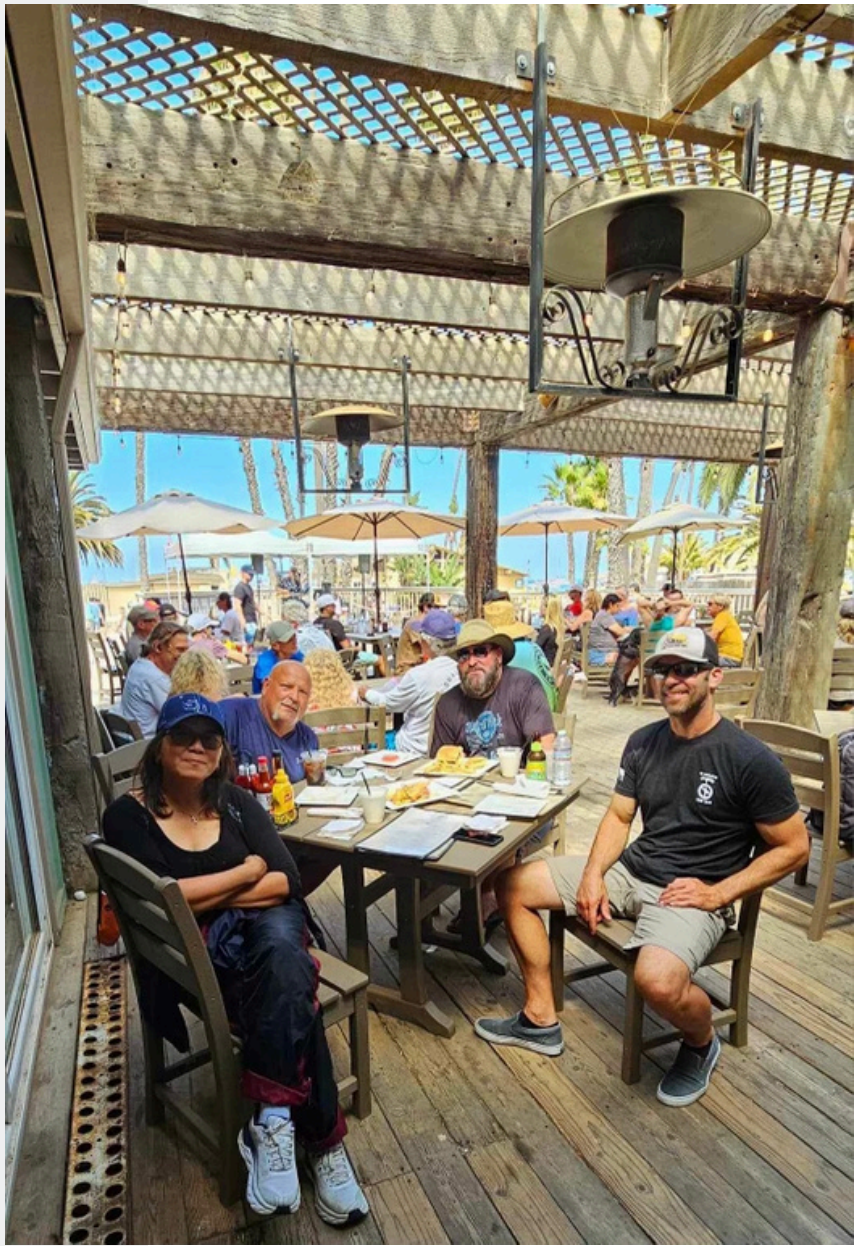
Harbor Reef Restaurant at Two Harbors