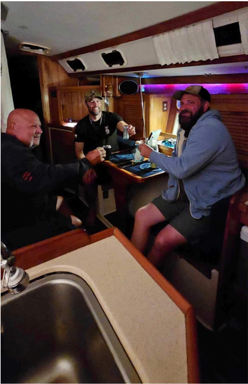
Drinks on S/V Tiramisu