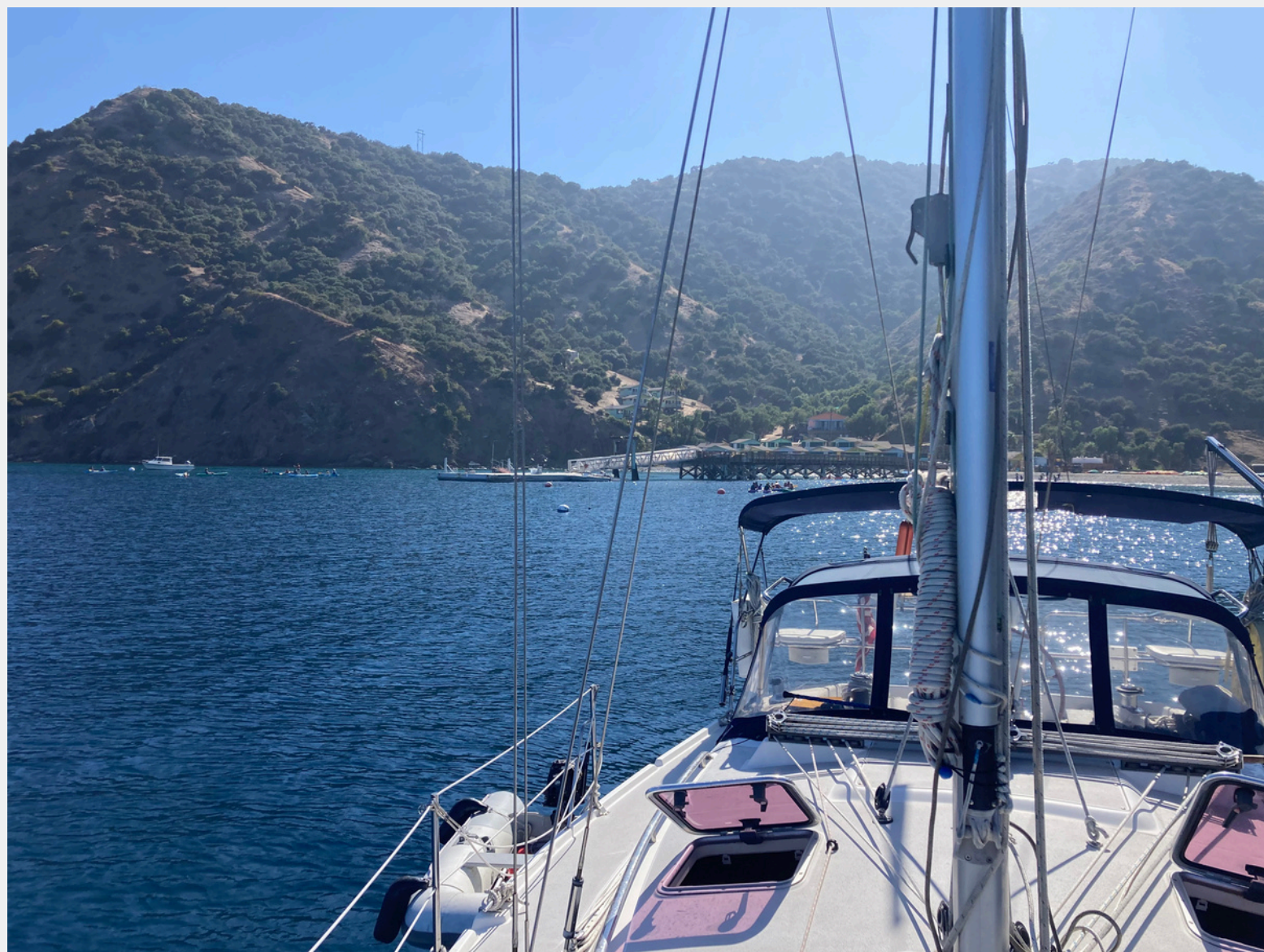
View of Shore from S/V Osprey at Hen Rock