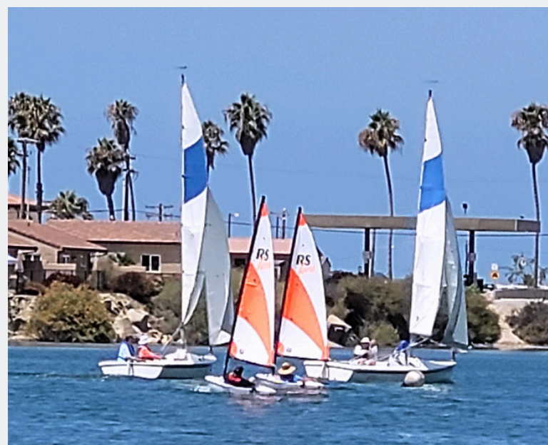
First race with the RS Tera fleet