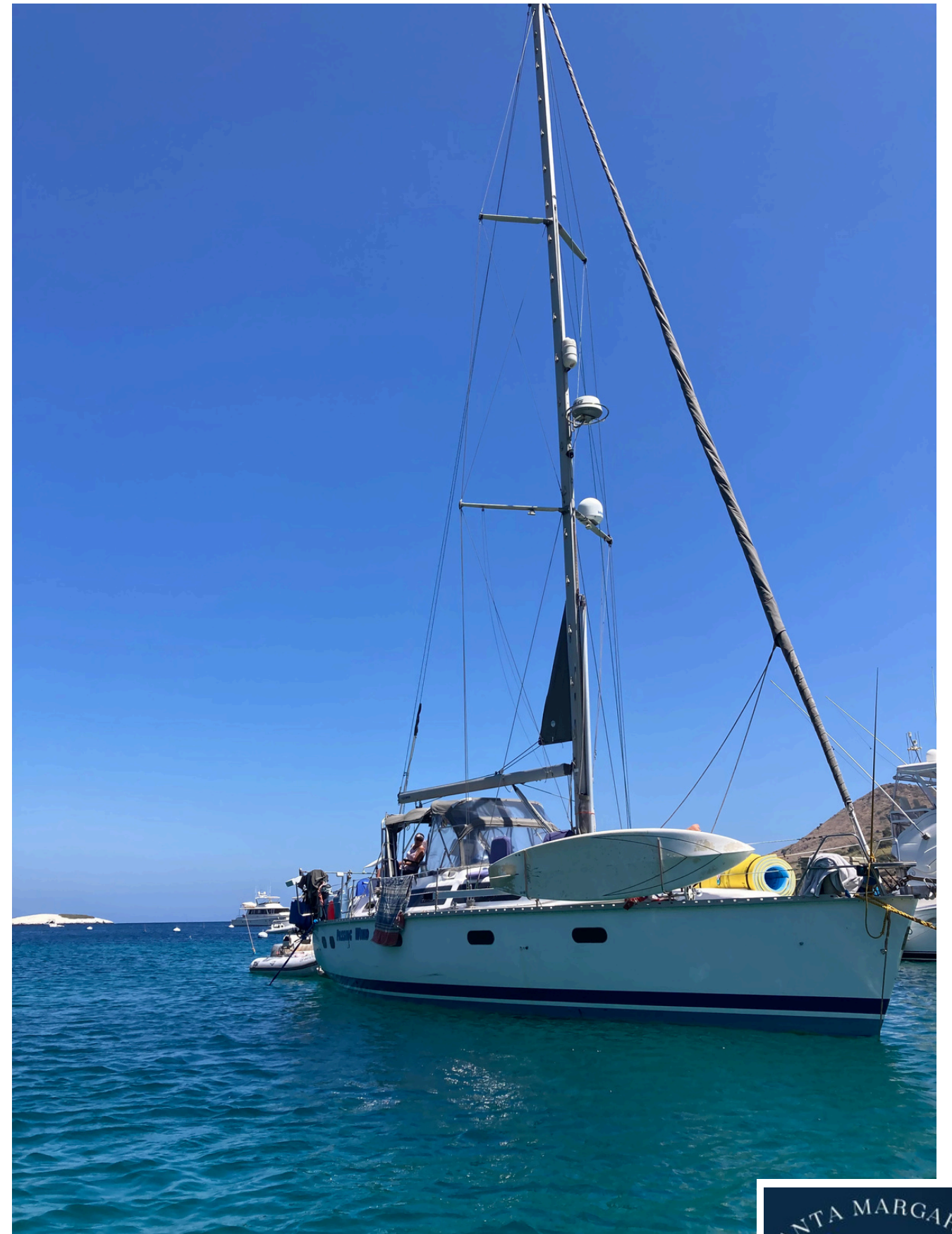
S/V Passing Wind at Two Harbors

DEL MAR MARINA, OCEANSIDE, CALIFORNIA 92054, UNITED STATES