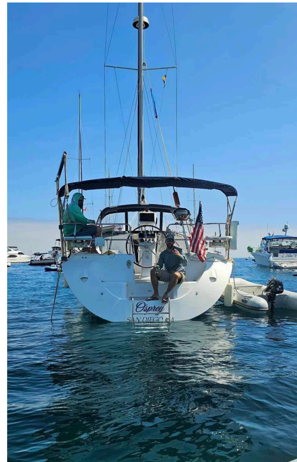
S/V Osprey at Avalon