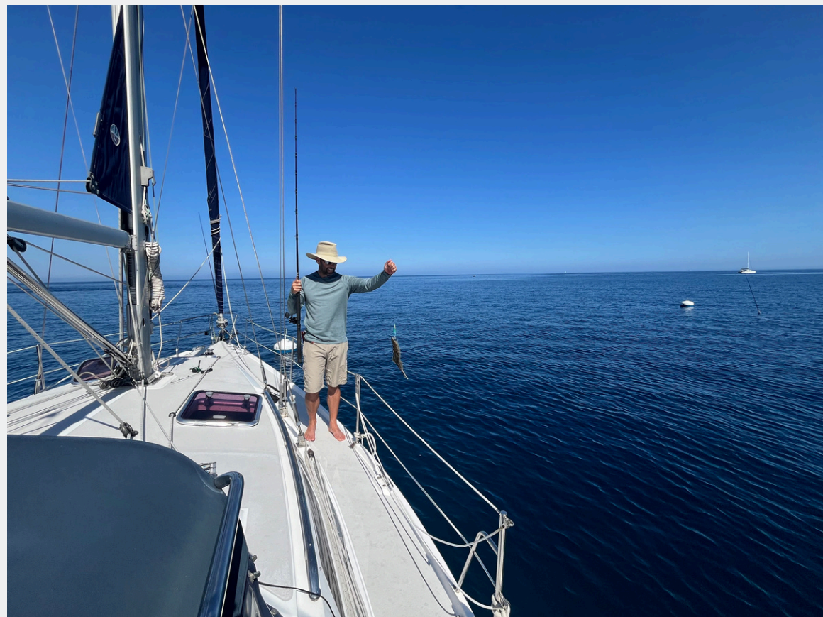
Fishing at Hen Rock