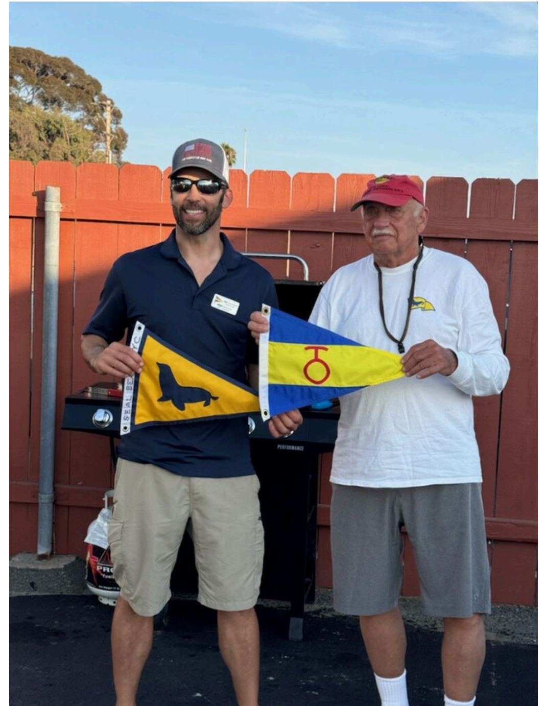
SMYC Burgee Exchange with SBYC