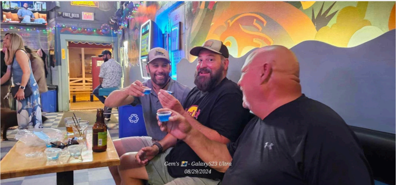
Marlin Club at Avalon