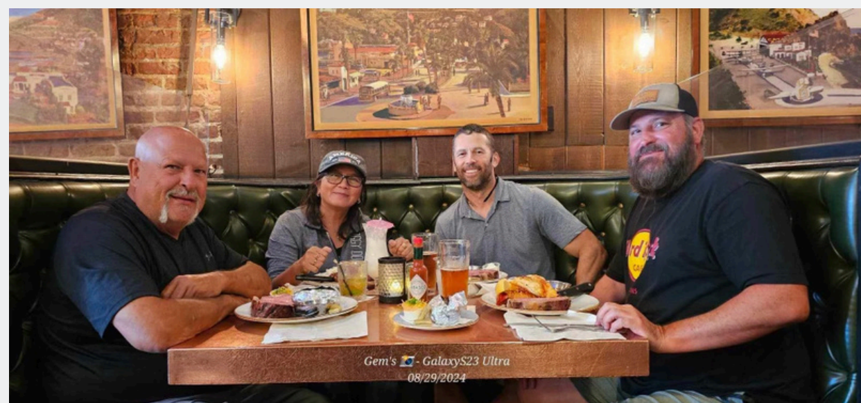
Dinner at El Galleon in Avalon