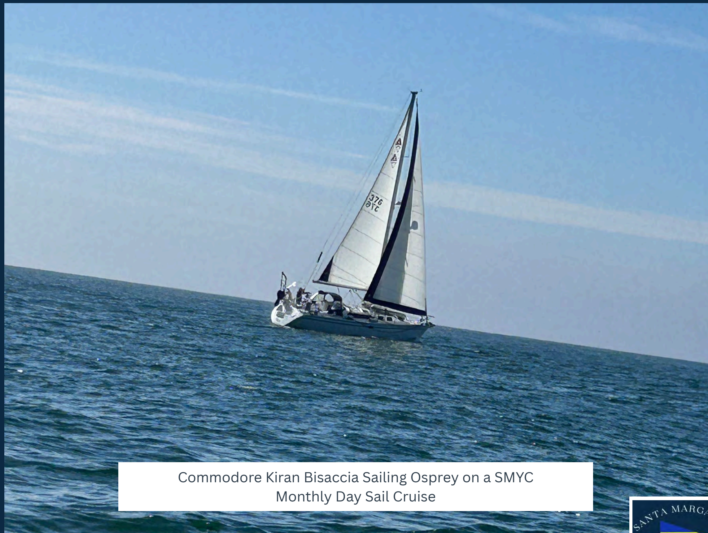
Commodore Kiran Bisaccia Sailing Osprey on a SMYC Monthly Day Sail Cruise