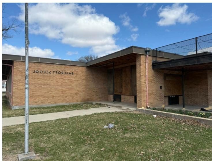
Bancroft Elementary School

Time marches on, but memories stay with us forever.