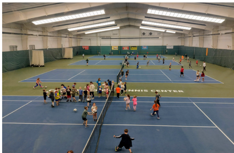
Montgomery County United Soccer Program

For more information about the Montgomery County Family YMCA, its programs, memberships, and volunteer/donor opportunities, call us at 712-623-2161, stop by the Y located at 101 East Cherry Street, Red Oak, Iowa, visit us on Facebook, or our website at www.mcyymca.com .