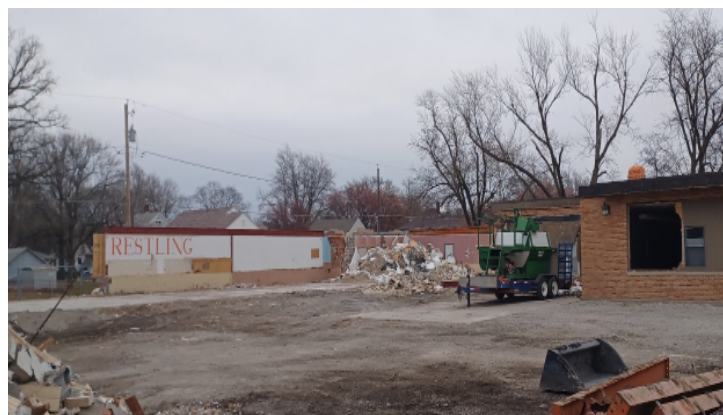
Bancroft Elementary School Demolition