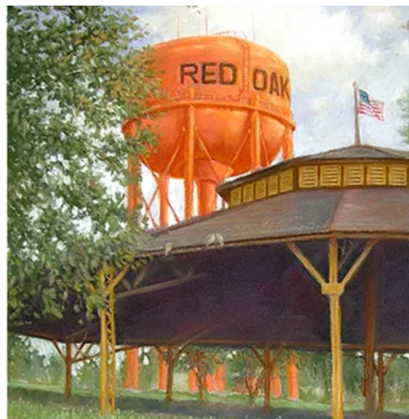
Illustration by Red Oak Artist Carroll Danbom