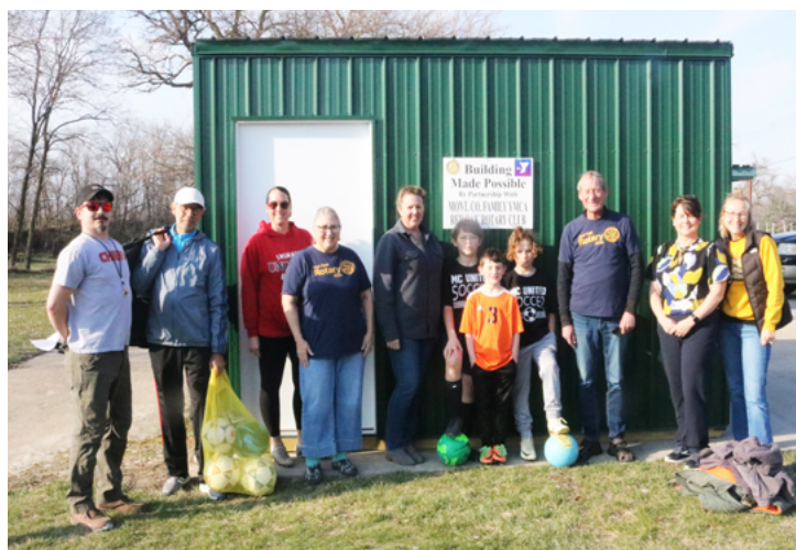
YMCA Soccer Shed

The WIBIT, a new water feature installation in the Y's Wilson Aquatic Center, kicked off Summer in the deep end of the pool on Saturday, June 1st and Sunday, June 2nd. The FREE event for the community introduced the fun lily pad, rolling log, and climbing mountain/slide obstacle course. As kids and some adults tried