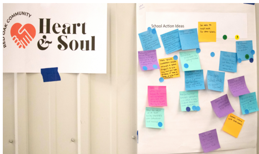
Top: Red Oak Heart & Soul school themed action ideas.