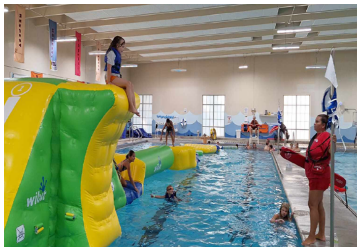
YMCA's Wilson Aquatic Center new WIBIT water feature