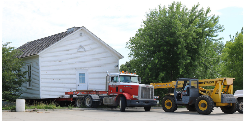
Pittsburg School relocation to the Montgomery County History Center

Thank you to the Red Oak Express for providing background information for this article.