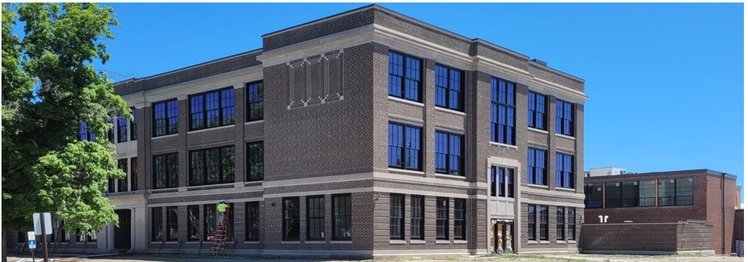
Red Oak Middle School 1917 Loft Renovation Project

A preview of an article coming in the October edition. Whether you called this building the High School, the Junior High, or the Middle School, coming this fall 25 families will call it "home". Lots of photos will reveal what the classrooms looked like when you called this school your home away from home and what those classrooms will look like as a 1, 2, or 3 bedroom apartments.