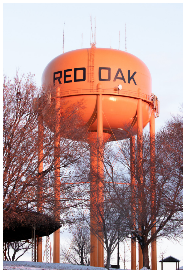
Red Oak Water Tower