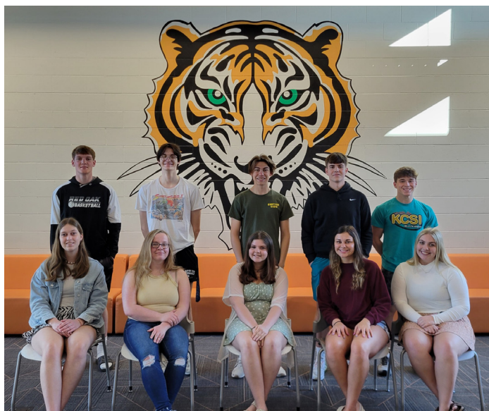
Congratulations to the 2023 Red Oak Prom Court!

On April 1, Red Oak High School hosted the IHSMA Solo/Ensemble District Music Contest. The Red Oak Vocal Music Department had 24 entries in the contest that were made up for 35 students. 14 of the groups/solos received I-Superior ratings, 9 groups/solos received II-Excellent ratings, and 1 soloist performing for comments only.