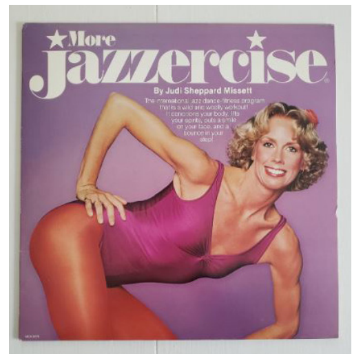
Jazzercise by Judi Sheppard Missett Vintage Workout Fitness Dance Record -- Retro 1980's Cardio Work Out Vinyl