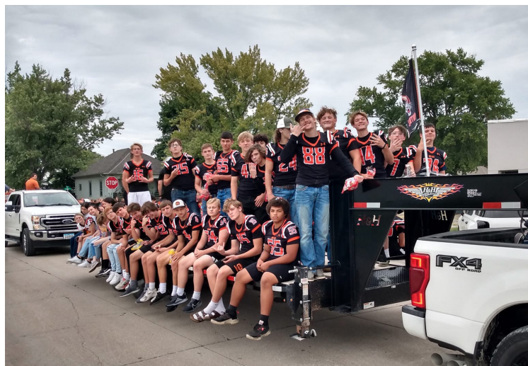
Red Oak Tigers Football Team in Homecoming Parade

Our varsity volleyball team is currently 17-12 overall. They are 6-1 in the Hawkeye Ten Conference which has them in 2nd place. As always, this group has one of the toughest volleyball schedules in our class in the state of Iowa. The season has been highlighted by a second place finish in our own tournament. The team finished runner-up to Mount Vernon who is currently ranked #1 in our class.