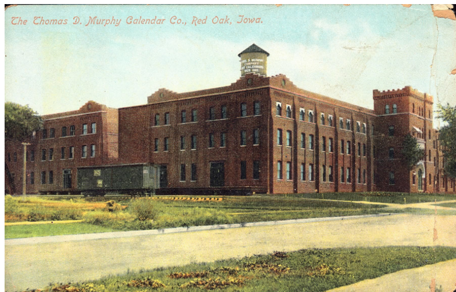
Postcard of Thomas D. Murphy Calendar Co. Red Oak, Iowa