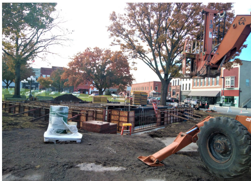
Ongoing progress on the stage in downtown Historic Fountain Square Park

Red Oak Chamber and Industry Association