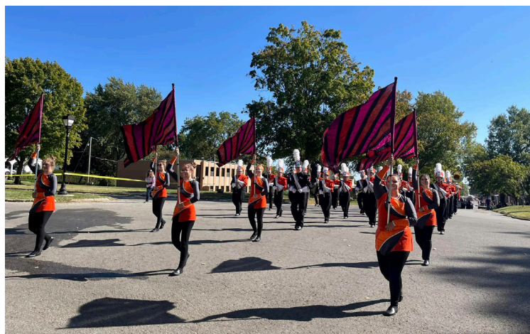
Red Oak Marching Band Performing