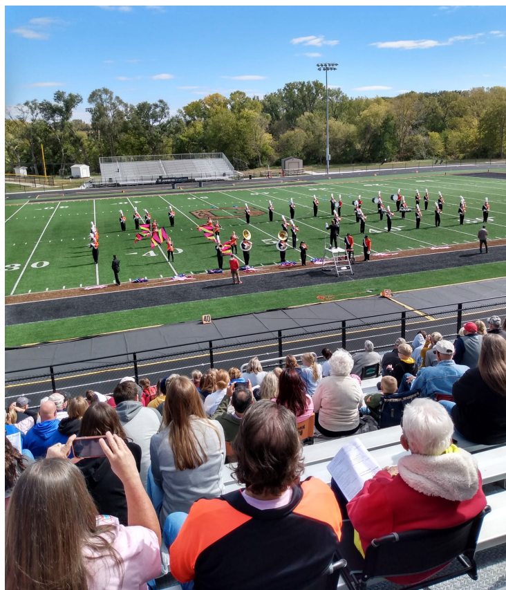
Red Oak Marching Band Performing

The 4-0 beginning of the season is the first such start in over 50 years. Overall we ended the season 5-4.