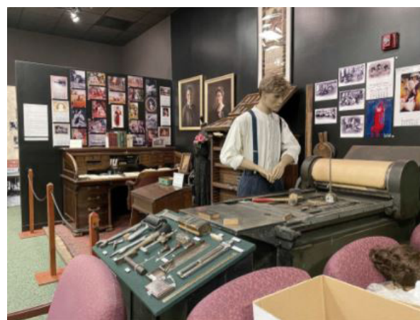
Thos. D. Murphy Calendar Company Display at the Montgomery County History Center

It has been claimed that Murphy's made Red Oak the birthplace of the art calendar industry.