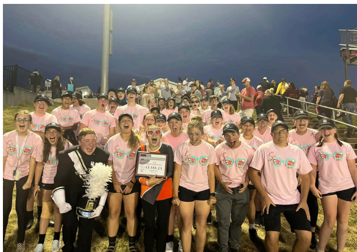
Marching Band placing second in the parade awards