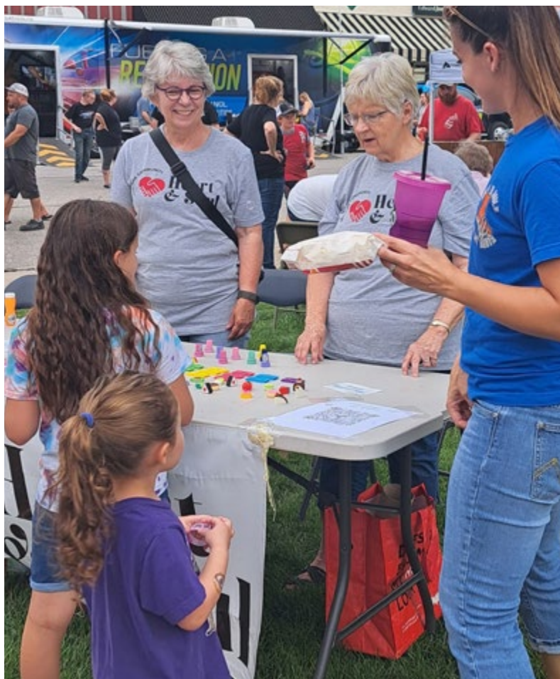
Red Oak Community Heart & Soul Booth at National Night Out

If you would like to get involved or learn more, there are many opportunities to volunteer, donate, or help spread the word. Red Oak Community Heart & Soul hopes to stand as a beacon of community-driven transformation, showcasing the power of unity and action that thrives in the heart of southwest Iowa.