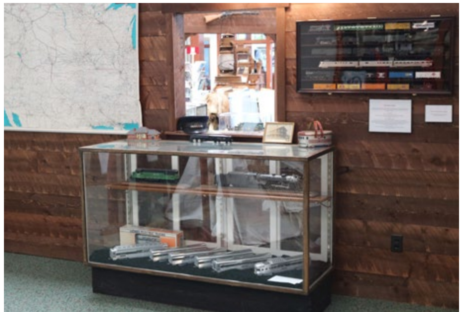
Montgomery County History Center Railroad Exhibit