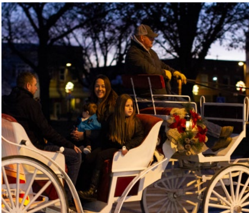
Red Oak Chamber & Industry Association Carriage Rides

The Cold Cash program continues to be a successful program that keeps those dollars local during the holiday season.