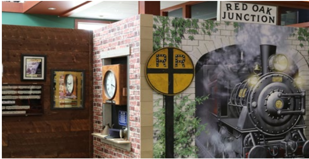
Montgomery County History Center Railroad Exhibit

We are unveiling a new exhibit at the History Center in connection with Red Oak history, especially. The exhibit features the local history of the railroad, which play a key role in the growth of the greater area.