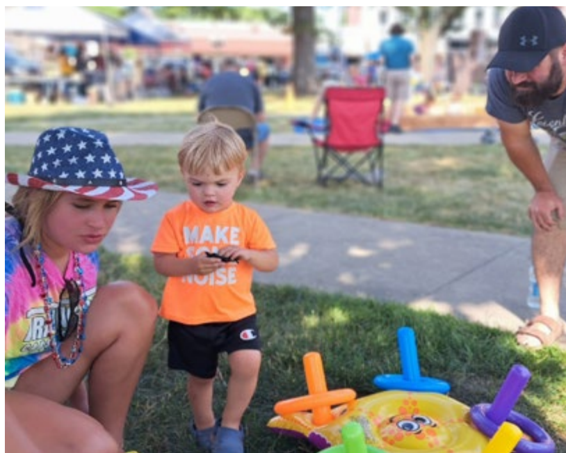
Red Oak Community Heart & Soul at National Night Out

To participate, the upcoming Phase II training is set to take place September 23 from 3 to 5 pm at FiveOne8 on the east side of Fountain Square, please RSVP to coordinator@roheartsoul.org . Snacks will be provided, and drinks are available for purchase.