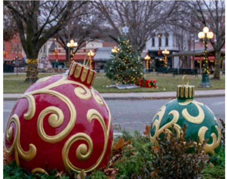
Red Oak Chamber & Industry Association Downtown Ornaments

Red Oak Chamber and Industry Association