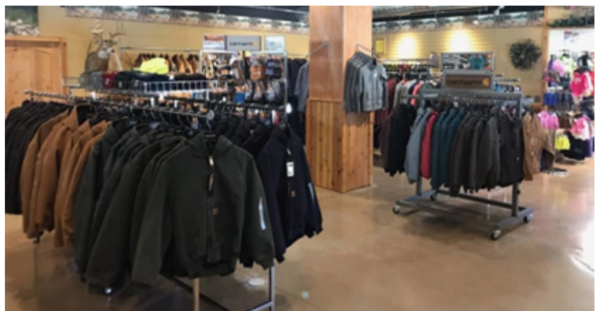
Red Oak Fabrication's Carhartt Storefront