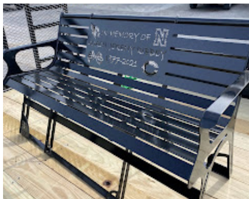
Personalized Memorial Garden Bench

This is truly a well-established heritage business that Red Oak can be so proud of knowing that its roots are well planted here, and their growth has expanded good quality jobs for so many.