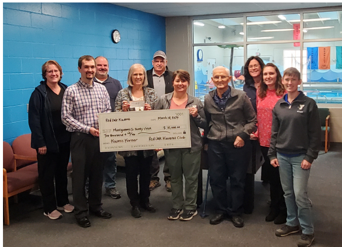
Red Oak Kiwanis Club’s donation of $10,000 to the Montgomery County Family YMCA