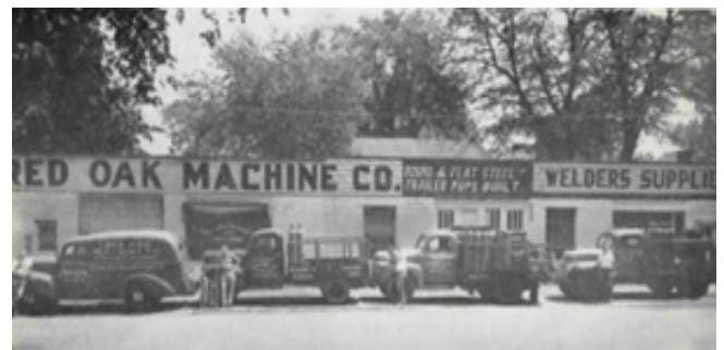
Red Oak Machine Co., www.redoakfabrication.com/about/