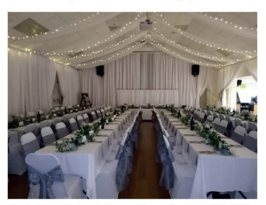
Our hall decorated ready for a wedding on September 25th 2021.

The trustees have been carrying out a review of the charity's facilities to determine essential repairs and maintenance requirements. Whilst investigating recent problems with the flat roof of the hall extension, documents were discovered showing that the roof of the extension has 'out-lived' the number of years for which it was originally designed. The Committee is continuing to consult on necessary works and obtaining quotes.