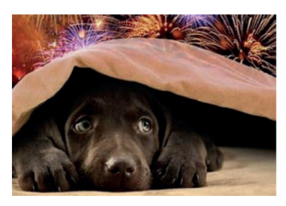
Think of pets on fireworks nights

Prints to frame, Images on acrylic, Canvases, Mugs, Cushion covers, Gift Vouchers for sittings (valid for 12 months).