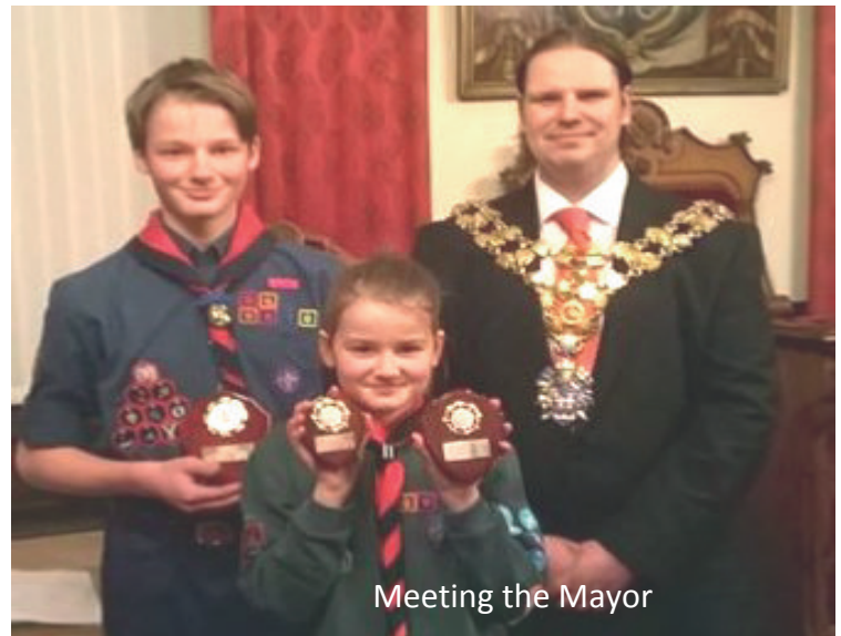
Meeting the Mayor

Now we are all looking forward to the warmer weather with a number of camps and a gliding trip planned.