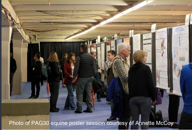
Photo of PAG30 equine poster session

International Society for Animal Genetics meeting, July 2-7, Cape Town, South Africa