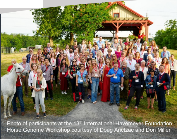
Photo of participants at the 13 th International Havemeyer Foundation Horse Genome Workshop