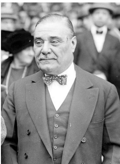
Ruppert in 1923

Jacob Ruppert, Jr. (August 5, 1867 – January 13, 1939)