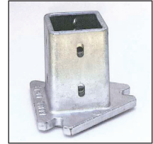
S-Q 10 Casting with 3" square perforated galvanized post and Cast Base.

The S-Q 10 System features a triangular slip base with 10" sides and is designed to be used in applications where larger signs are required.