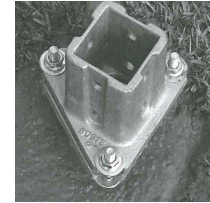
S-Q 8 Casting with 2.5" square perforated galvanized post and Cast Base.

The S-Q 8 system features a triangular slip base with 8" sides and is designed to be used in combination with our ground stub system or retrofit onto existing 8" triangular ground stubs.