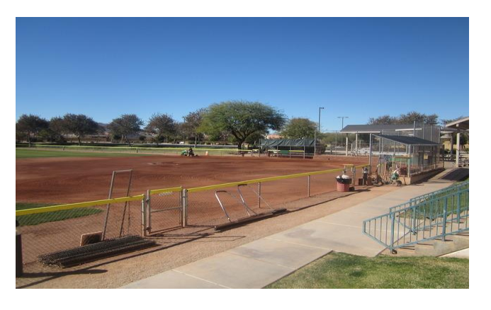
Softball Field The Arizona Traditions softball field welcomes players of all ability levels. Play on a team that competes against other area communities, or simply play for fun.