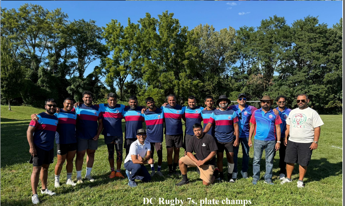
DC Rugby 7s, plate champs