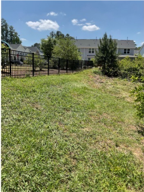
BMP3 back of dam