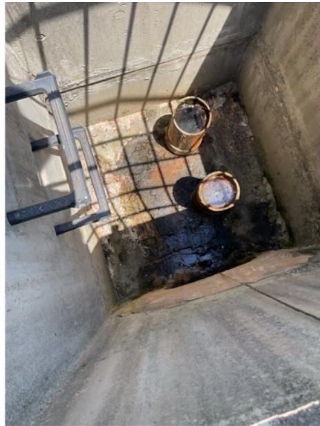
BMP3 inside riser