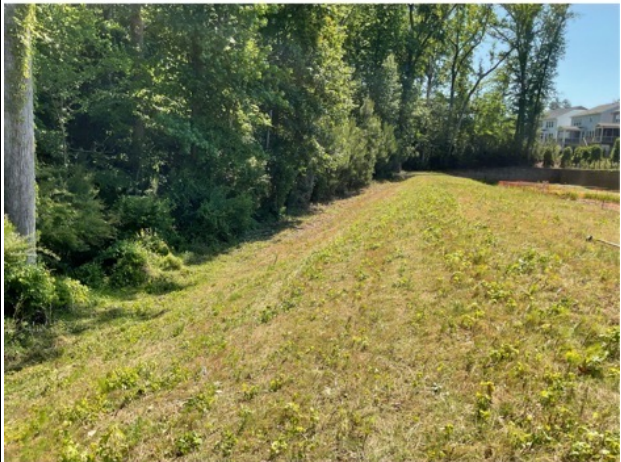
BMP2 back of dam