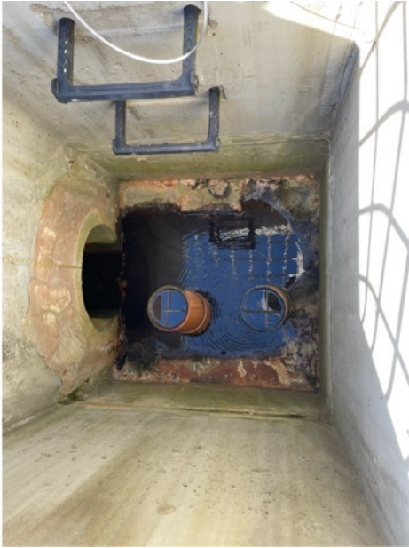
BMP3 inside riser