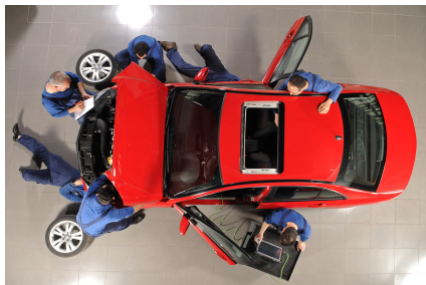
Zach Overby, Technician

We have inspected your vehicle with the following results: