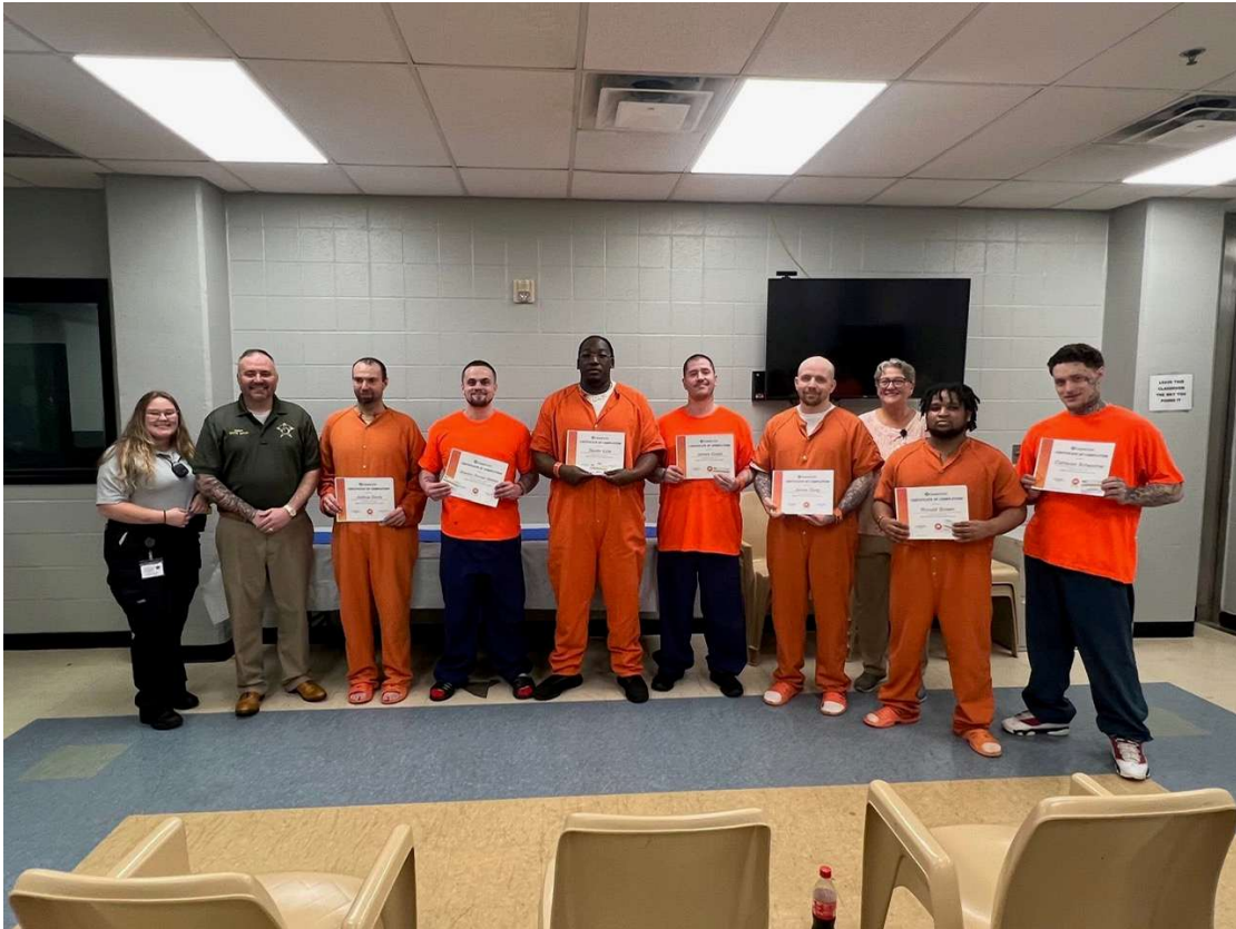
Graduation of OSHA-10 program October 17 th , 2025.