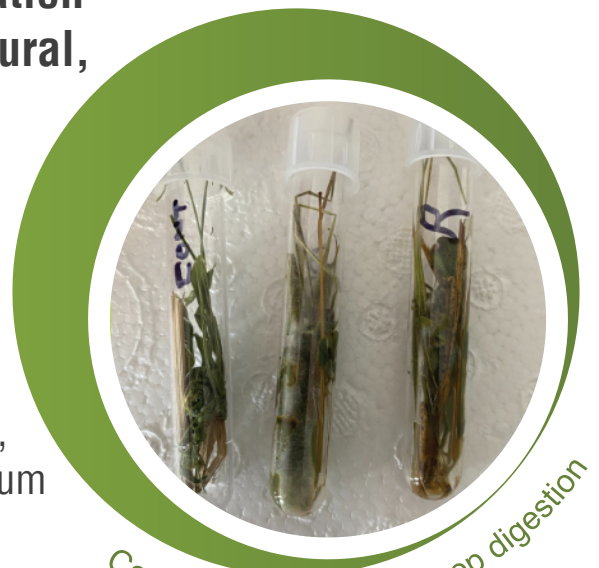
Control (left) vs. MicroChop digestion (center and right)

MicroChop is also manufactured using Pursanova activated water to improve total viability and increase absorption. Contains live microorganisms and works best above freezing.