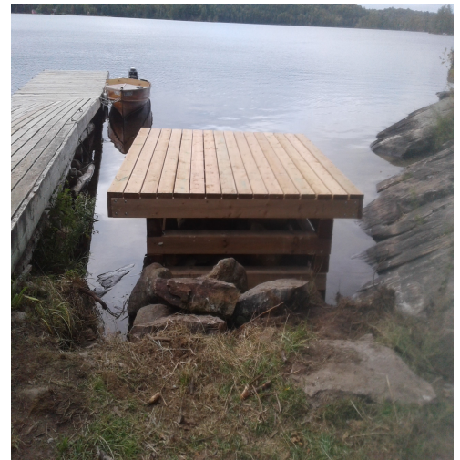
New crib added Sept 19, 2018

He also contacted Nature clubs in the area and received "an overwhelming response" pinpointing 18 locations from Mattawa, Temagami, Lake Nipissing, Restoule and more. continued on page 4