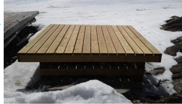
New Crib - Spring 2019