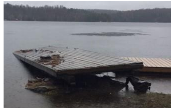
Spring ice out damage to the main dock - April 2019 (new crib fine!). Main dock moved back into place for now - thank you team of 4!