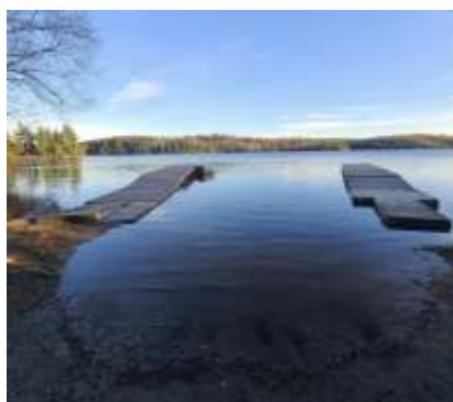
Flooding at Duck Lake Launch - Spring 2024

There was a large Osprey nest that I am sure most everyone saw on the larger island on Duck Lake – Miller Island. Last fall a bald eagle was witnessed for nearly 3 days destroying the ospreys' nest, after the osprey were gone South. The osprey were spotted, circling the lake in mid April, I'm assuming looking for a new roost! Hopefully everyone can keep an eye out, and we will find their new home to continue to see them!