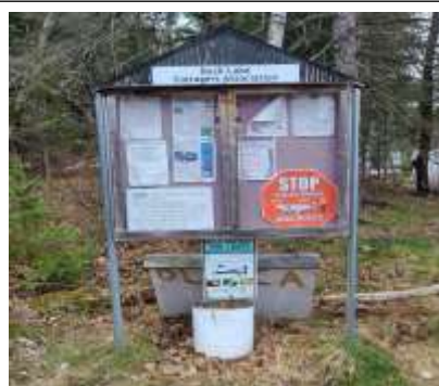
New signage at bottom of Signboard at Duck Landing