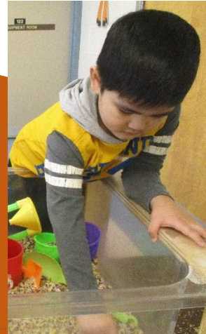
The children enjoyed Miss Tricia's colorful rice sensory bin for weeks! The children practised scooping and pouring; added construction vehicles; mixed it with clay and even made music shakers.