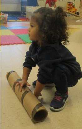
They showed us creative ways to play with the cardboard tube.