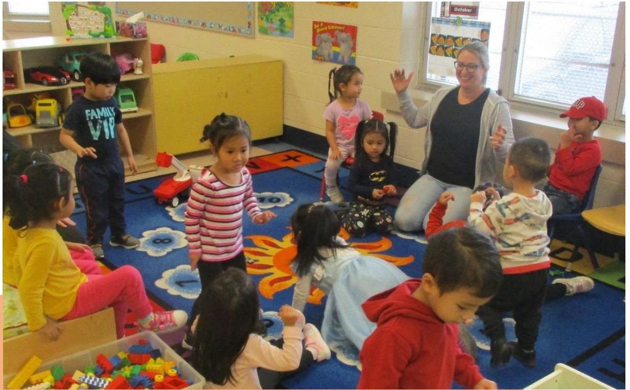
Group time means fun time with friends!